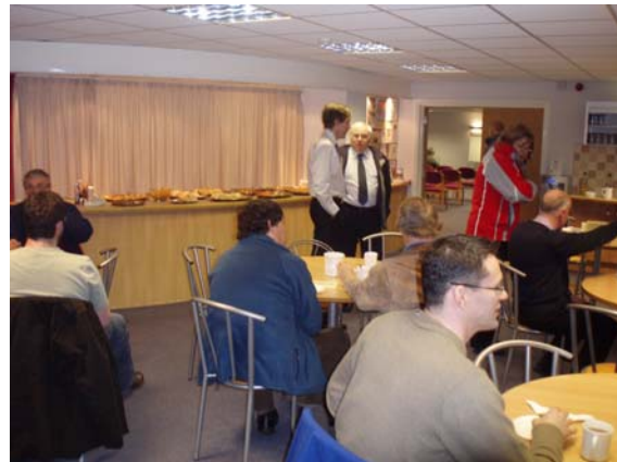
The food going down well !

Watch this space for future free alumni seminar announcements!